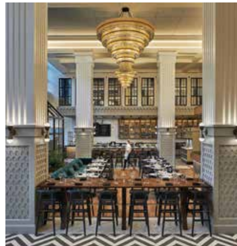
Set within Pendry San Diego, Montage’s first location of its new elegant affordable hotel brand, Provisional Kitchen, Cafe & Mercantile features seasonal fare, a communal dining area with a coffee bar, and a marketplace offering ceramics, jewelry, and gourmet food products.

The second Auberge resort in Mexico after Esperanza, Chileno Bay features a contemporary design. Marble-floored bathrooms have Mexican tile walls, and floor-to-ceiling pocket doors open wide to views of palm trees and the ocean. Amenities include three pools, one for adults-only, another for families, and a third for kids, as well as a spa, and a fitness and movement center. A 20-seat theater accommodates private screenings, and staff members supply various lawn games, such as bocce ball, Jenga Giant, and golf putting. Bartenders lead adult games, like TnT (Tacos and Tequila), a drinking version of Spanish bingo, at the beach bar.