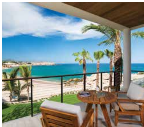
In a villa at Chileno Bay Resort & Residences in Los Cabos, a master bedroom and terrace overlook the Sea of Cortez and a deep soaker tub stands ready to pamper.